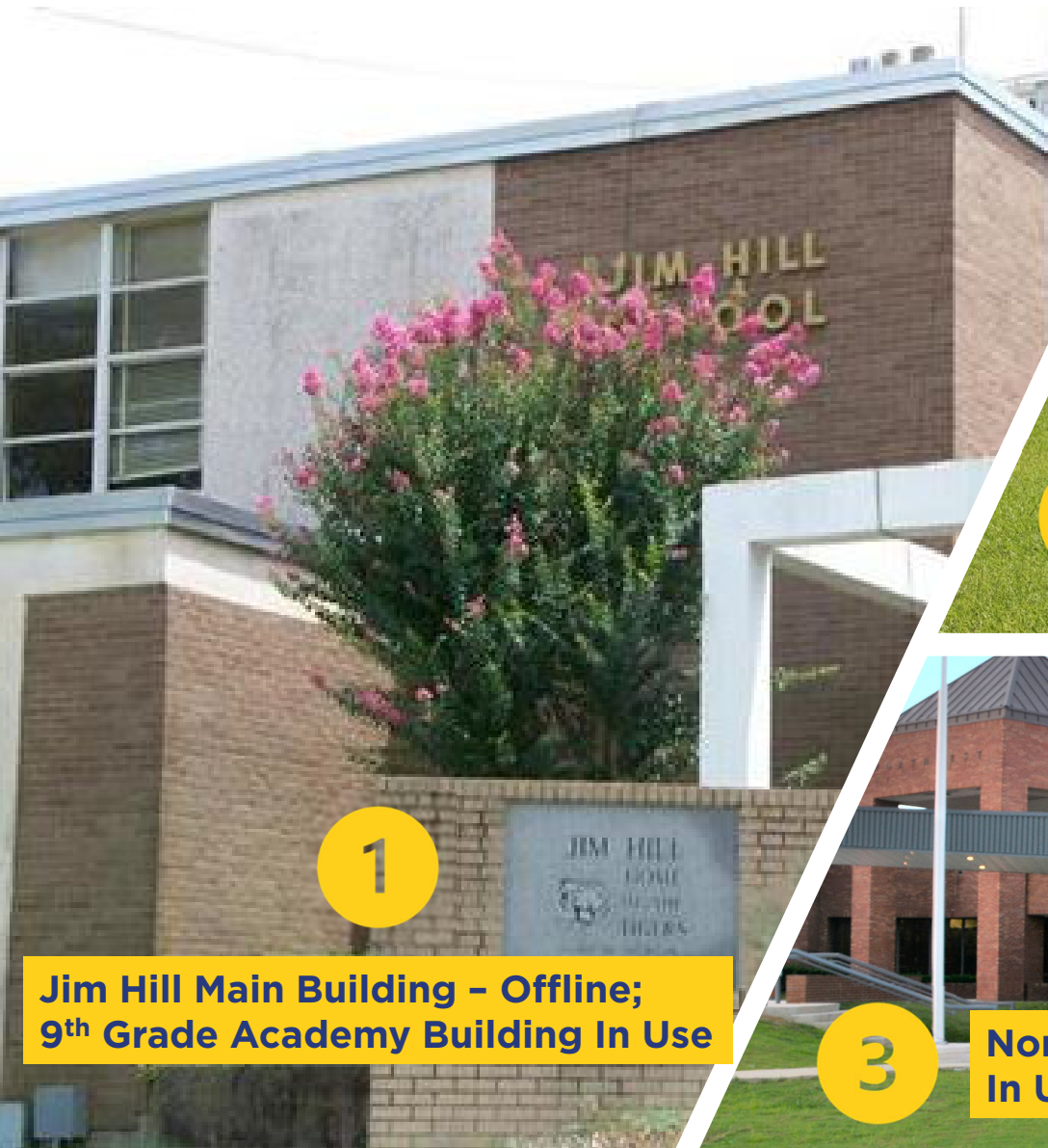
Jim Hill Main Building - Offline; 9 th Grade Academy Building In Use