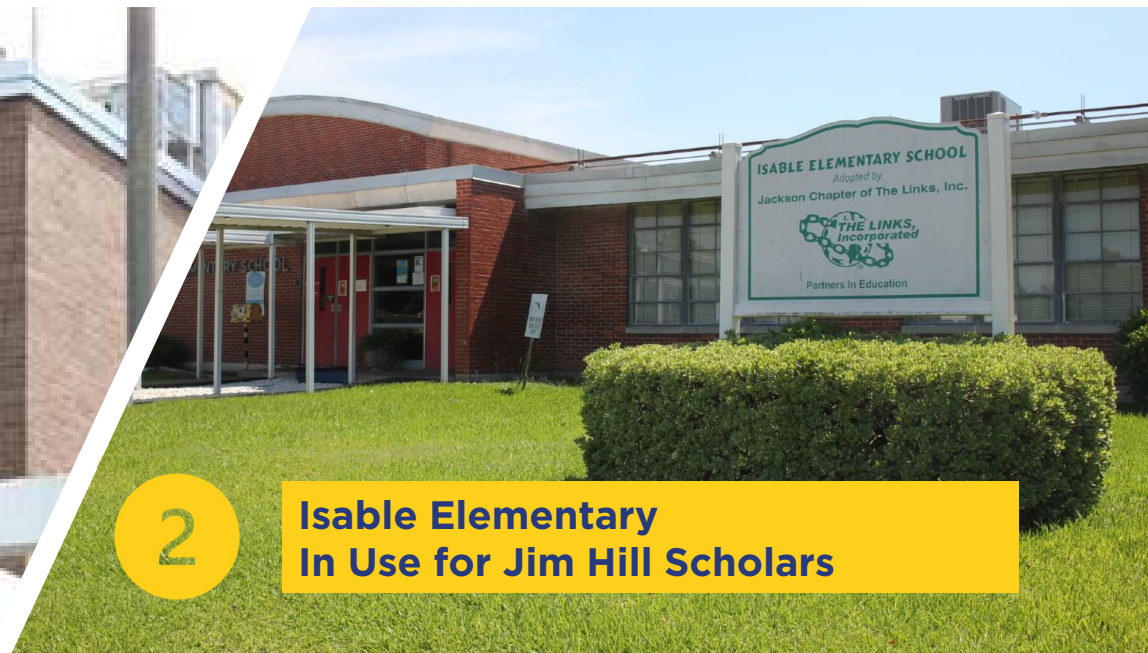
Isable Elementary In Use for Jim Hill Scholars