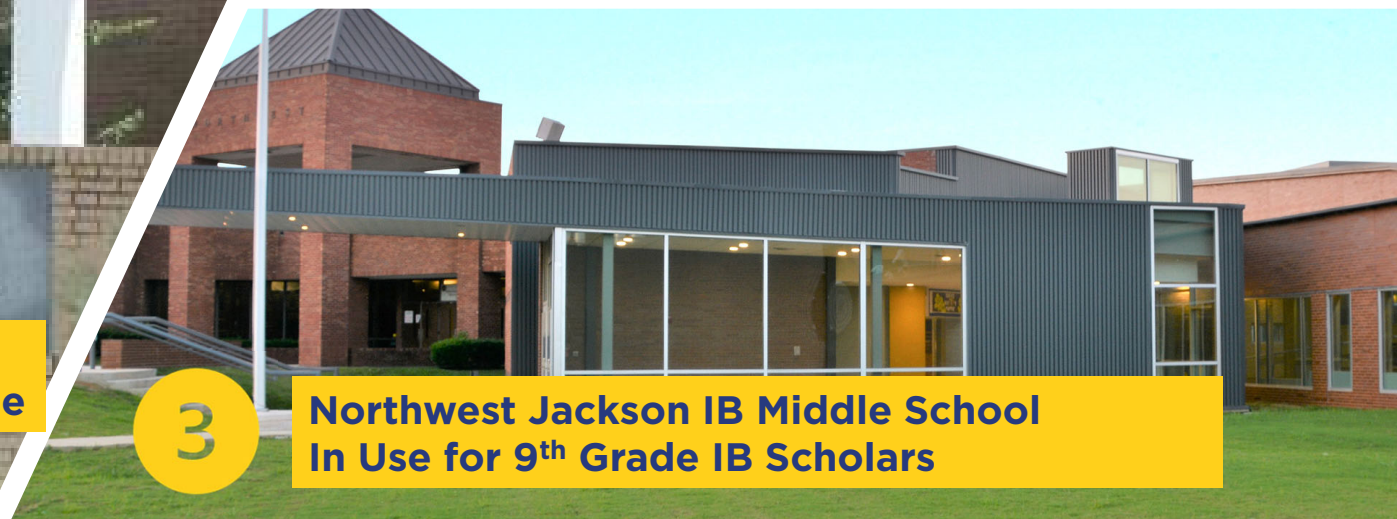
Northwest Jackson IB Middle School In Use for 9 th Grade IB Scholars