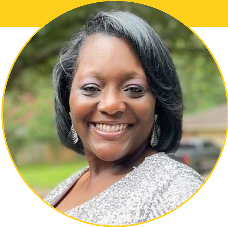
Yosantas Burton Lake Elementary